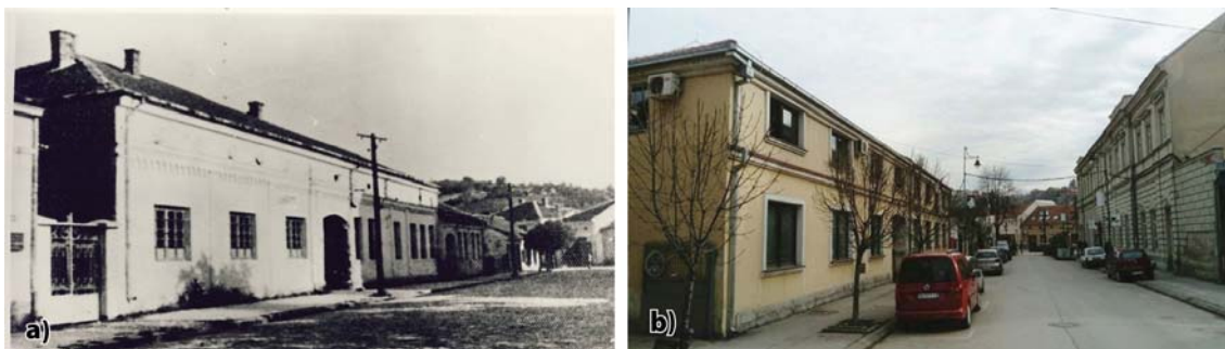
Fig. 1 – a) The building where the Military Hospital was situated, and b) today's view of the same building after it has been completely reconstructed; on the right side, you can see the building where the Hotel Sekulić used to be.

By further research, we came across a photograph took in Valjevo in 1914/15 by a Dutch surgeon Dr Arius van Tienhoven, where the yard of Military Hospital of Valjevo can be seen. It was published in the 1st Dutch edition of his book of memory of war events 1914/15 48 , but it was not published in the Serbian edition 49 . There could be seen a part of the courtyard of the Military Hospital with a longitudinal ground-based facility. It was just a part of the hospital complex, and the whole could be recognized on the geodetic plan of Valjevo from 1926, where this yard was also recognized 50 (Figure 2).