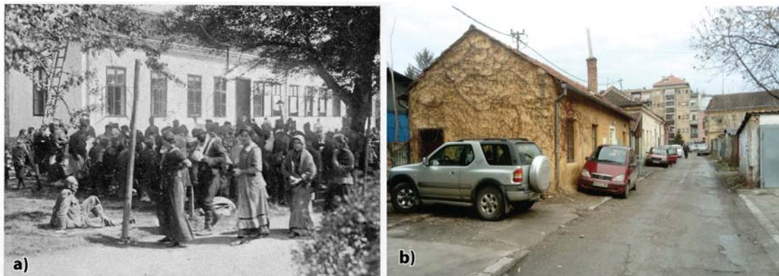
Fig. 3 – a) A view on the Military Hospital from the inner yard on the photography taken by Arius van Tienhoven in 1914 (A. van Tienhoven De gruwelen van der oorlog in Servie – het dagboek van den oorlogs-chirurg. Den Haag; 1915), and b) today (photography: V. Krivošejev).

Finally, it is necessary to emphasize that the mentioned complex in which the Military Hospital of Valjevo used to be, still exists. The street-side building belongs to the company Erozija, and it has the same dimensions; it was