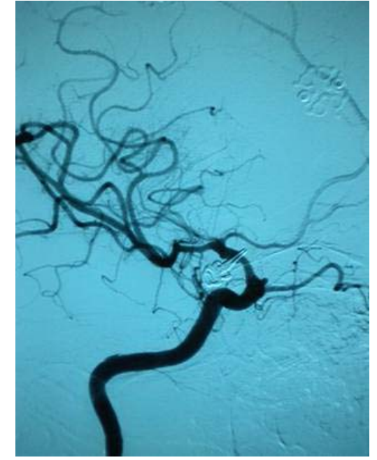
Fig. 3 – Immediate postoperative cerebral digital subtraction angiography shows complete obliteration of the aneurysm.

In the early postoperative period after surgery the patient awoke with right ophthalmoplegia. Immediate postoperative angiography showed the absence of aneurysm rest (Figure 3).